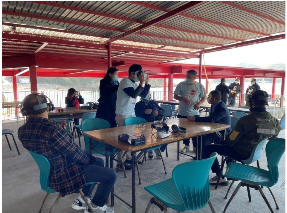
VR Game with drug information and related quiz playing by participants