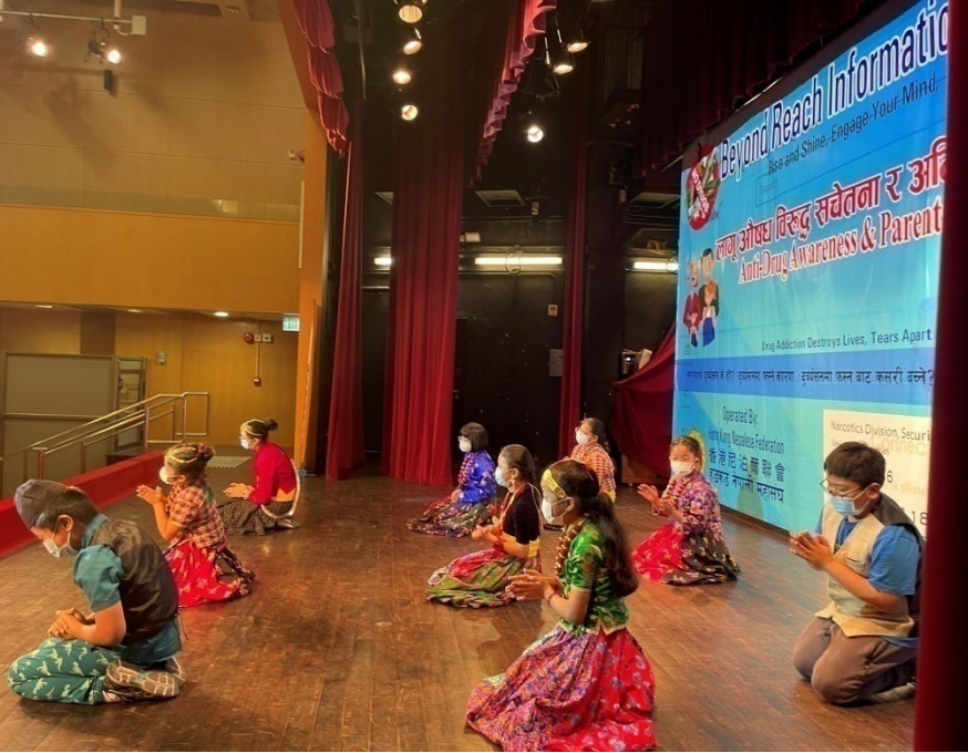
BRIP - dance students performing in anti-drug seminar