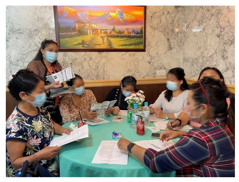
Parental skills evaluation-ND questionnaire filling by parents.