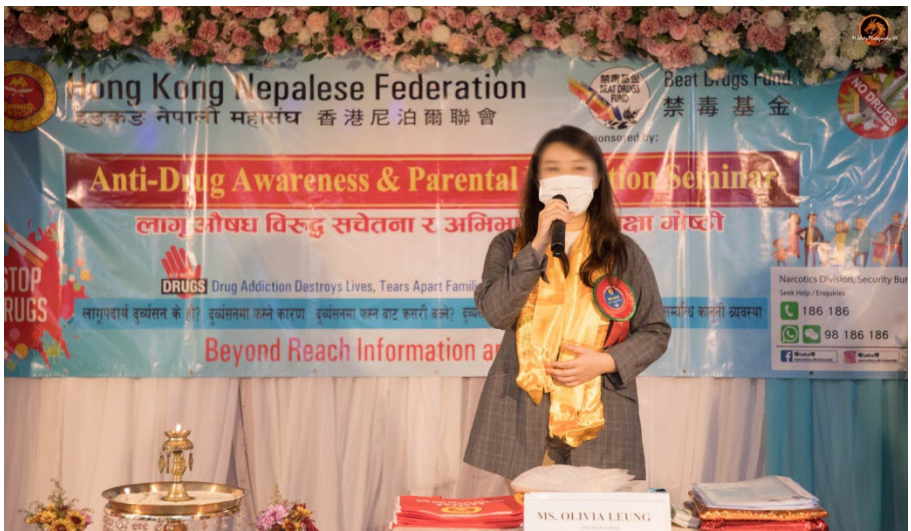
Speaker from The Society for the Aid and Rehabilitation of Drug Abuse

Token of love personated to speakers, (SARDA, HK Police, SRACP)