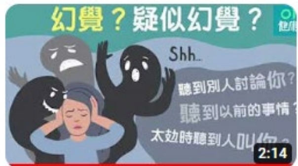
參賽者：(個人組) code: 9018