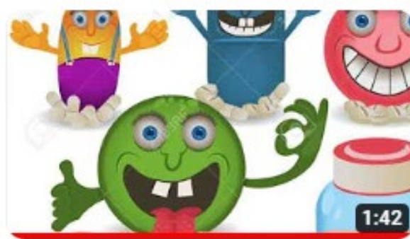
參賽者：(個人組) code: 9032