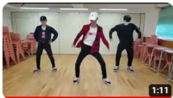
參賽者：(團體組) 無毒Cheer Up Pop Dance 跳舞短片 code：9002