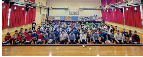
Lau Wong Fat Secondary School