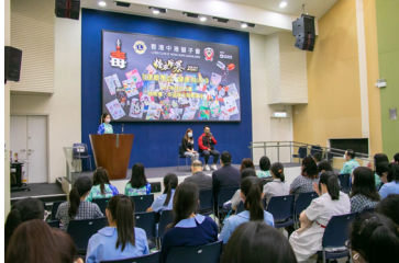
Anti-drug event of Lions Club of HK (Mainland)