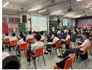
Cheung Chau Government Secondary School