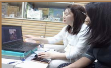
Online Child assessment