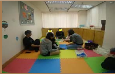
Parent support Group