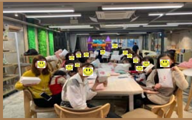
Interest development Activity