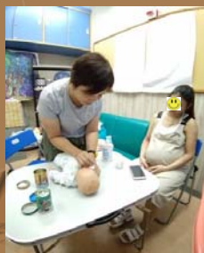
Prenatal Class for pregnant client