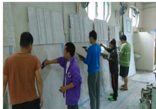
Painting and Decoration course