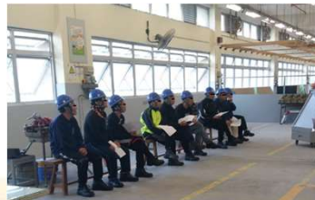
Construction Industry Safety Training Certificate test