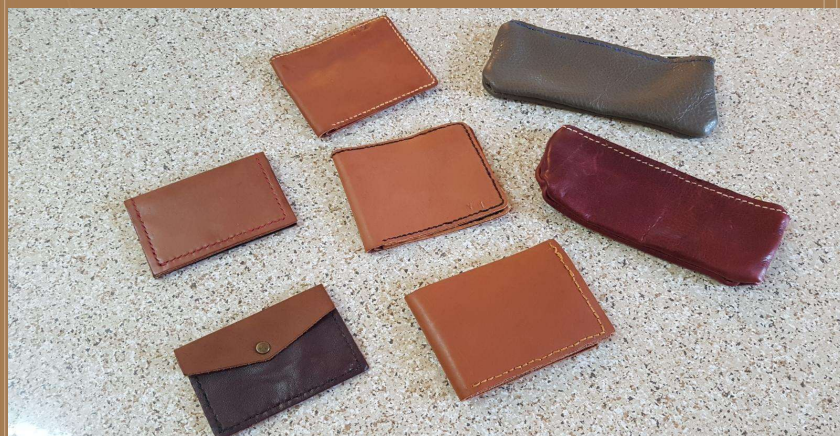
Leather products made by rehabilitees