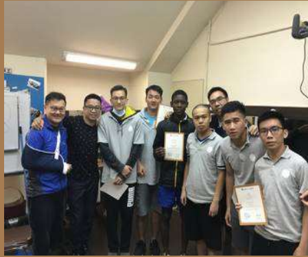
Rehabilitees receiving certificates in the hair dressing lesson