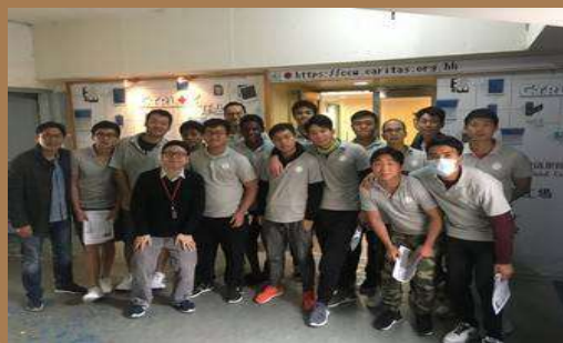
Visiting Caritas Computer Recycling Centre