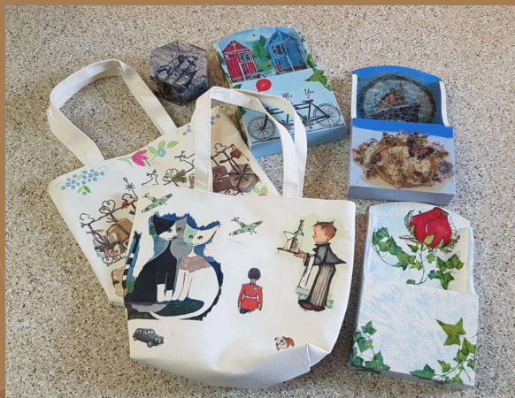
Decoupage products made by the rehabilitees