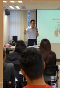
Addiction-related professionals attended the professional training in May and July, 2016