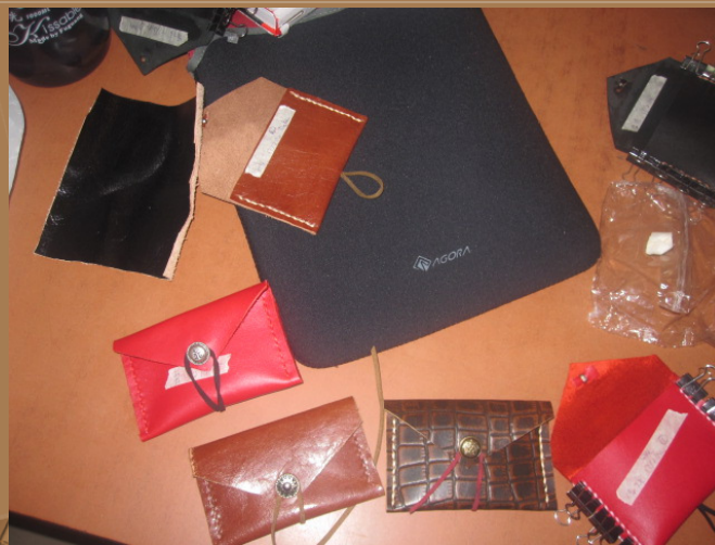
Leather products made by rehabilitees