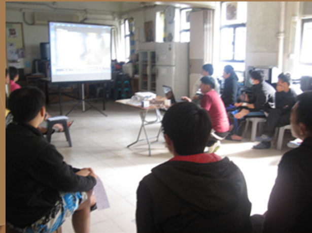
Ex Addict Sharing Session