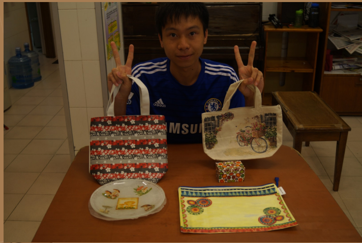
rehabilitee displaying decoupage products made by himself