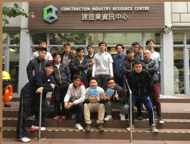
Visiting Construction Industry Resource Centre