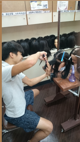
Rehabilitees having hair dressing lesson