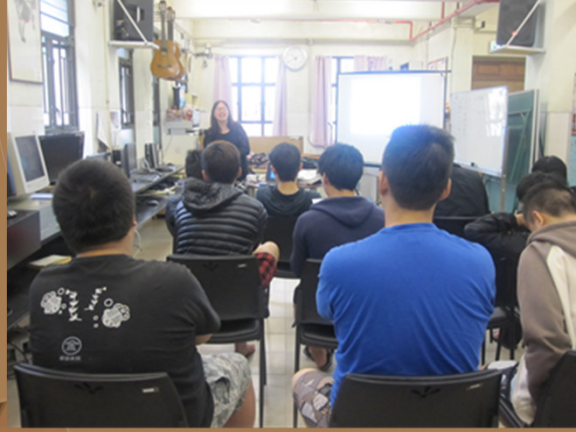
Emploment group once bi-weekly