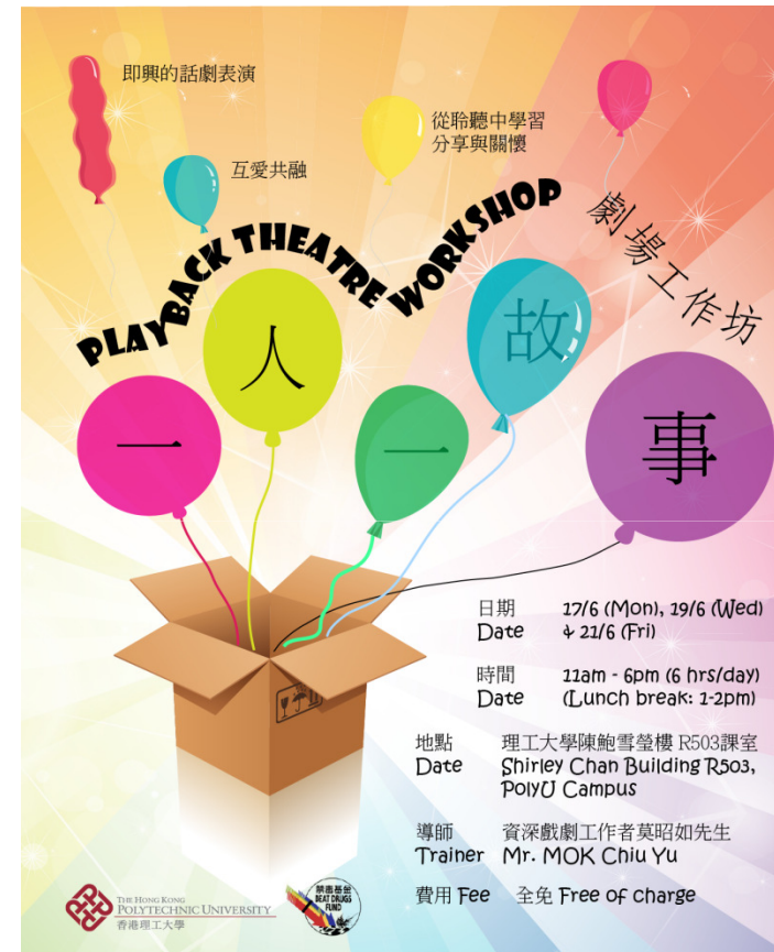
The promotional poster for the first drama workshop held on PolyU campus (2013-06-17, 1 st Drama Workshop)