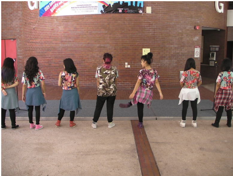
The dance performance has been enjoyed by all the guests during the opening ceremony. (2013-08-11, PolyU, Day Camp and Opening Ceremony)