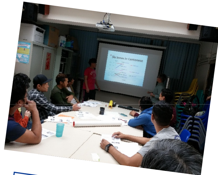
Our student mentor introduces six tones of Cantonese to the Nepali brothers. (2013-11-25, SRACP, 1st Cantonese Workshop)