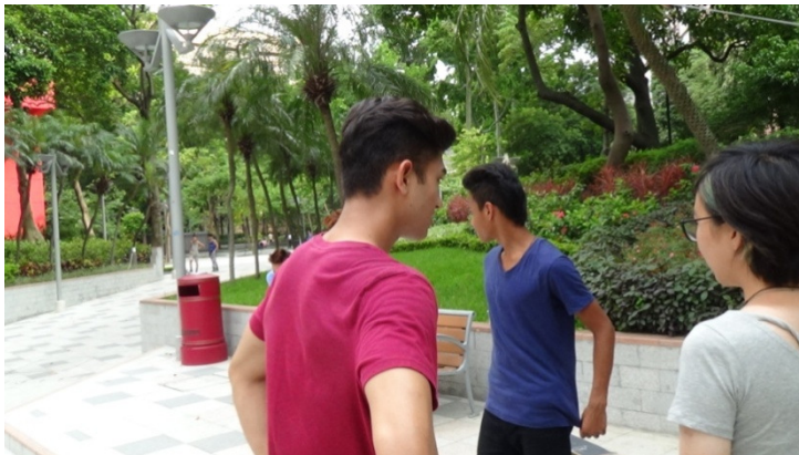
The skateboarder interviewees (2014-07-21, Tsim Sha Tsui, E-news on Skateboarders: Interviewing I)